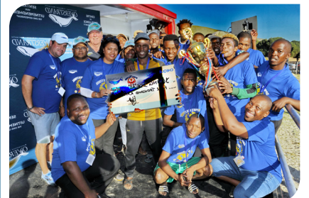
IYoung Ideas yaphumelela iSoccer Challenge