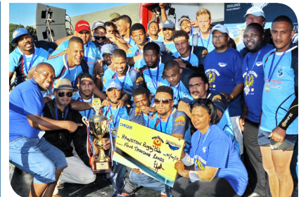
IHawston yaphumelela iRugby challenge