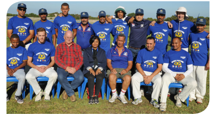
IHawston yaphumelela iCricket Challenge

IYoung Ideas yohlula iThemba Team kumdlalo wamagqibela-kankqoyi webhola ekhatywayo. Omabini la maqela ngawaseZwelihle.