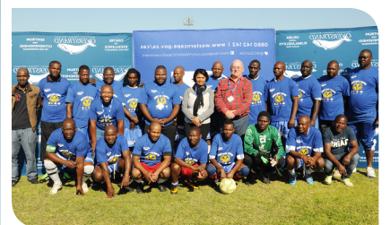
IGansbaai yakwazi ukuba igoduke nendebhe yezinyan ya zebhola ekhatywayo (Legends soccer trophy)