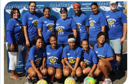
IMount Pleasant Netball team yaba kwindawo yesibini